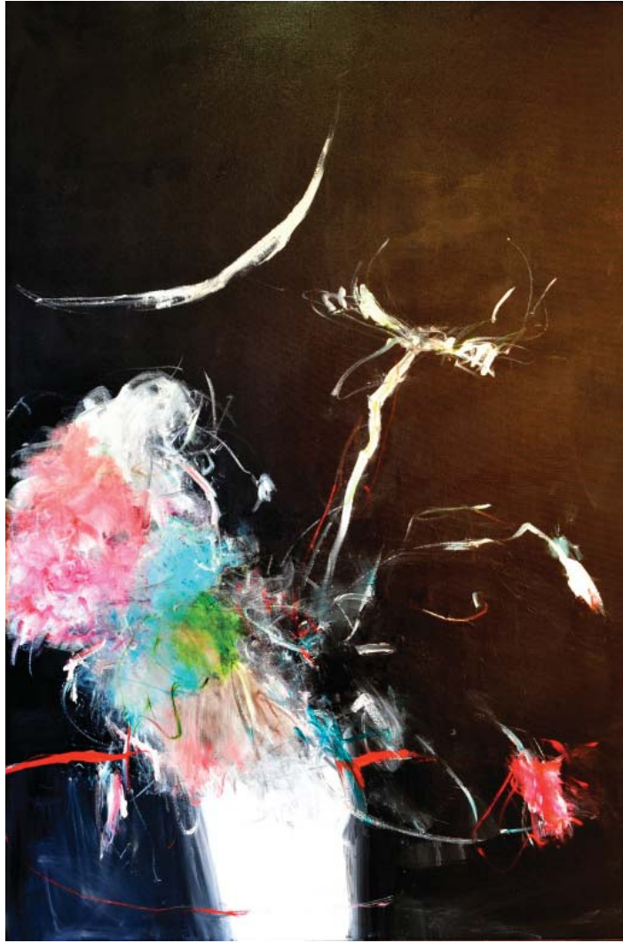
Oil & Acrylic on Canvas | 100cm x 70cm | 2008