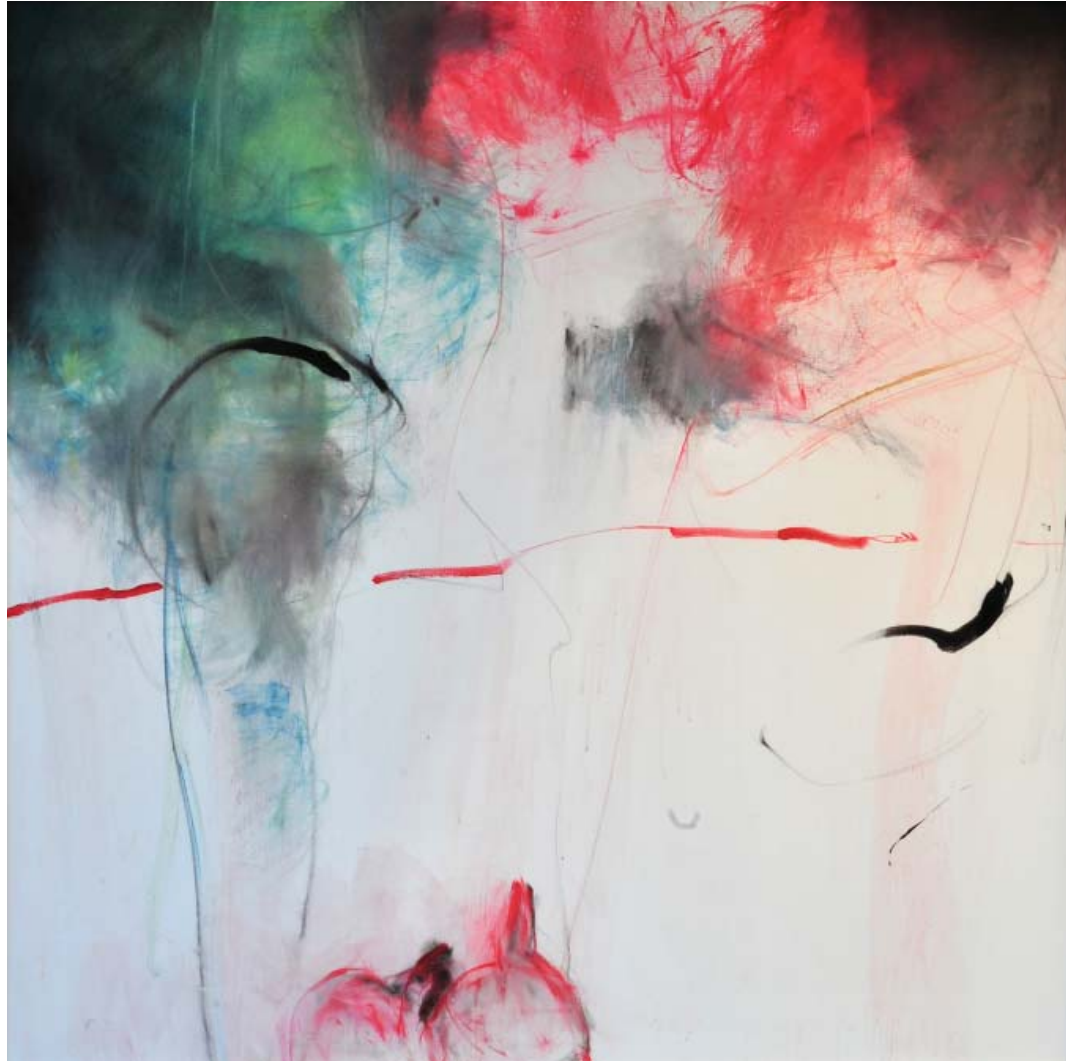
Oil & Acrylic on Canvas | 100cm x 100cm | 2008