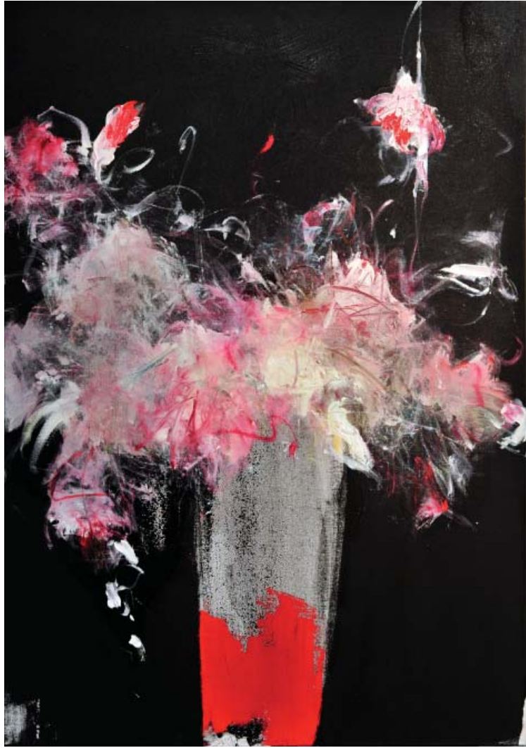
Oil & Acrylic on Canvas | 100cm x 70cm | 2008