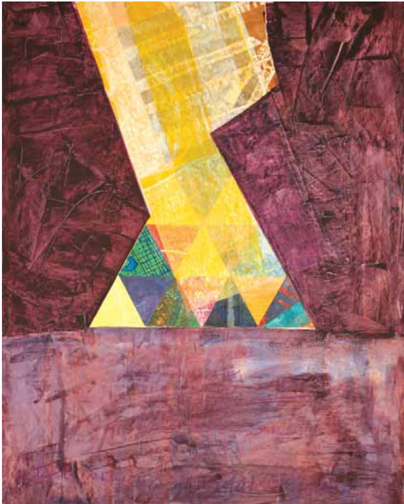
Mixed Media on canvas | 50x40 cm | 2008