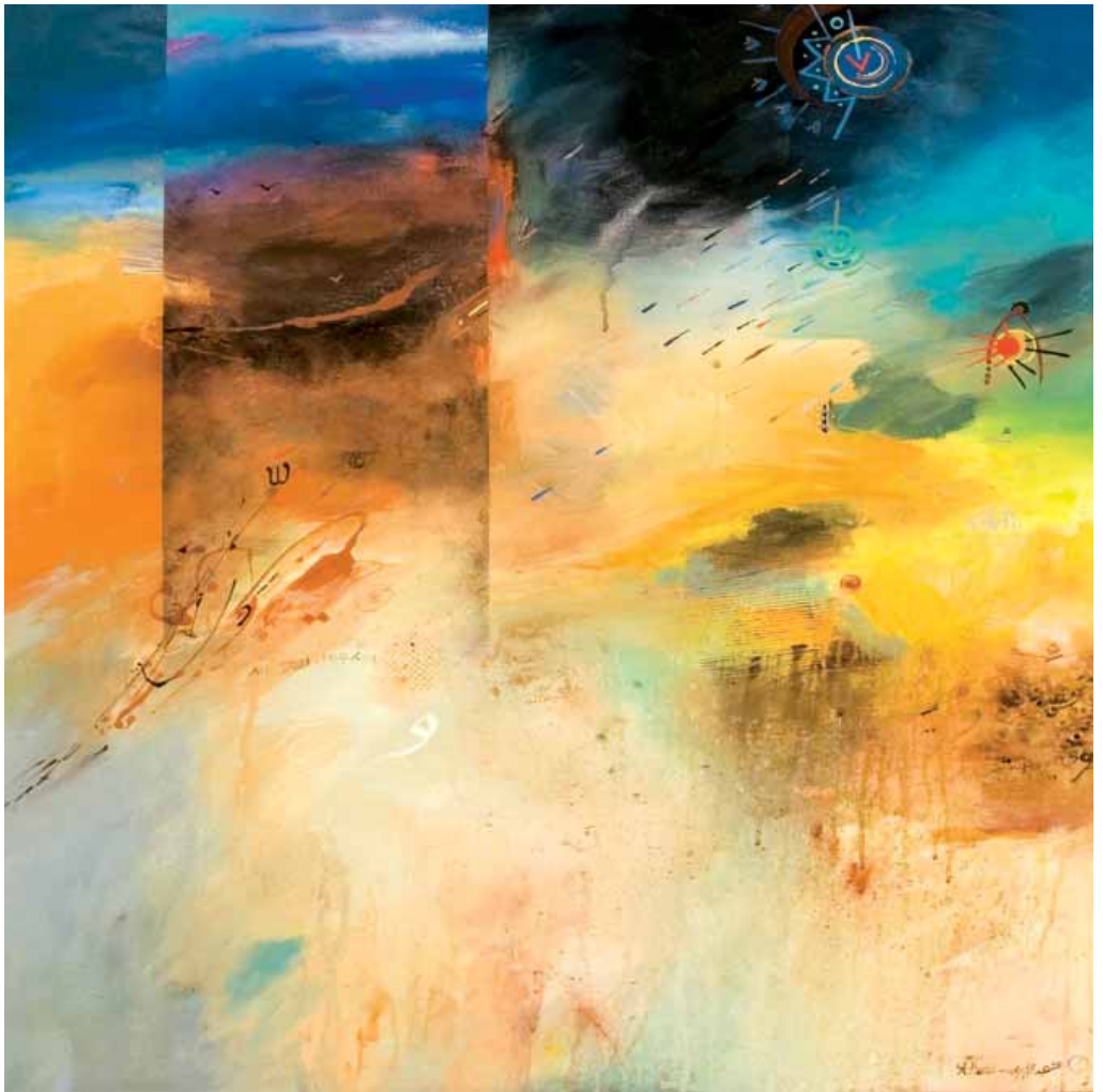
Acrylic on Canvas | 100x90 cm | 2007