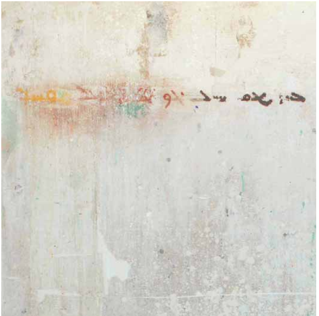
Mixed Media on canvas | 160x150 cm | 2008