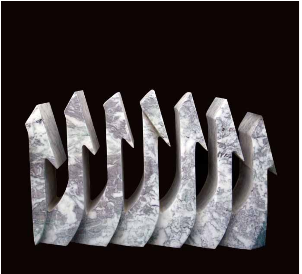
Alefat | Rosa Levanto-marble | 75x47x25 cm | 2008