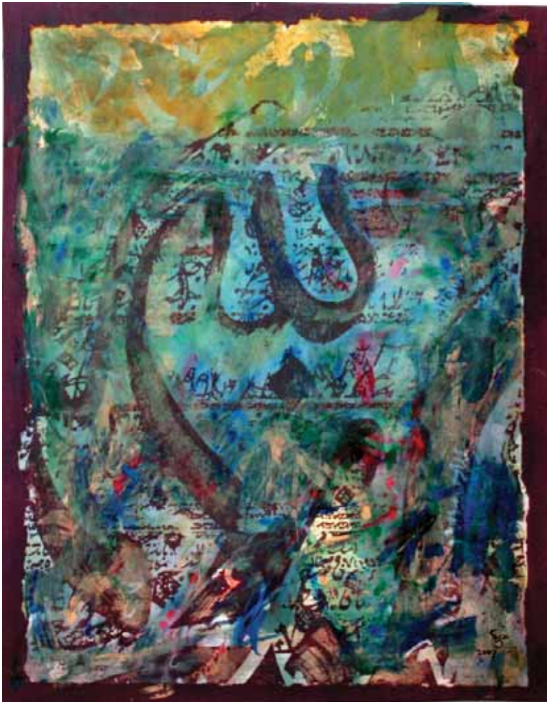
Acrylic on paper | 70x50 cm | 2007