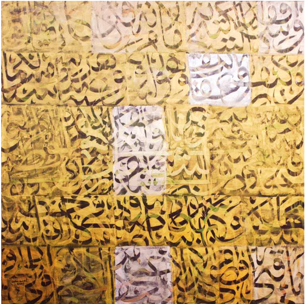
Al-Moutnabi | Acrylic on canvas | 94x94 cm | 2007