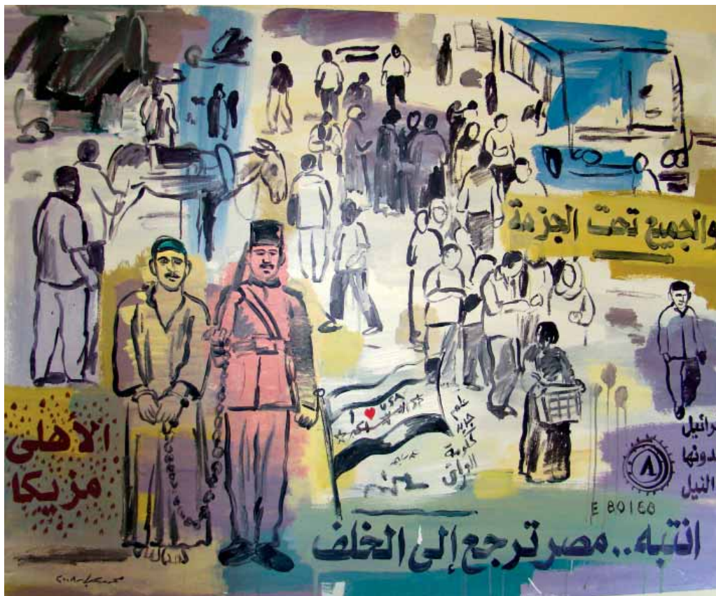
Street talks | 120x150 cm | acrylic on canvas | 2008