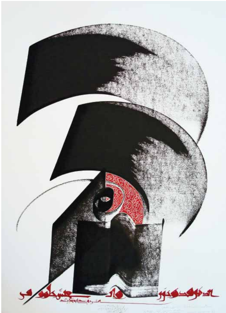
Ink on paper | 70x60 cm | 2007