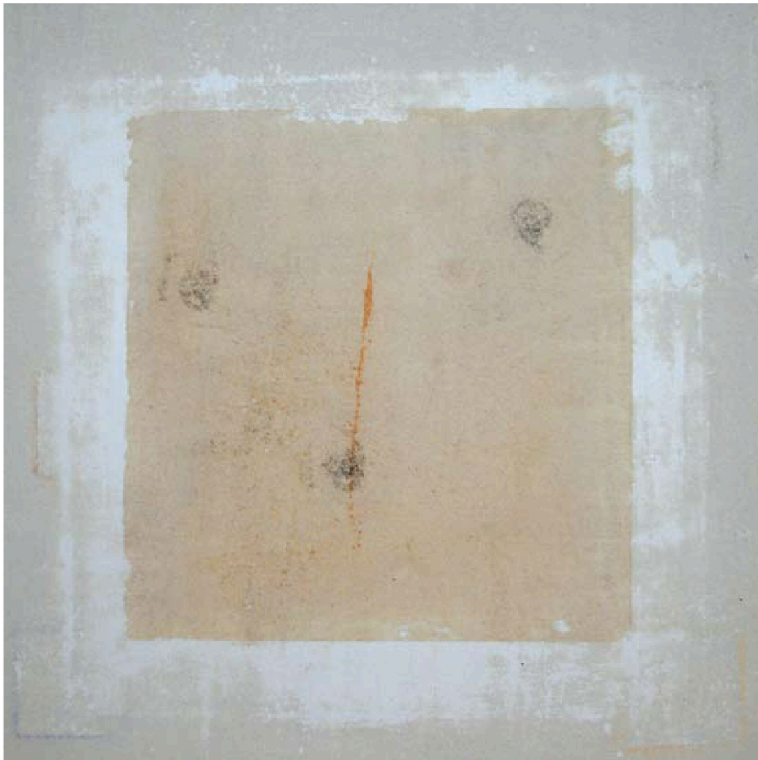
A21 \ 40x40cm \ Mixed media on canvas