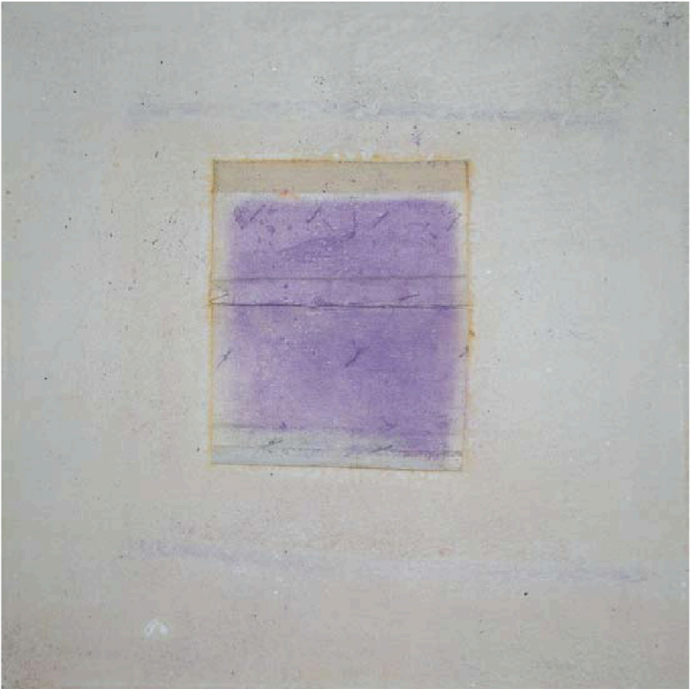
A11 \ 40x40cm \ Mixed media on canvas