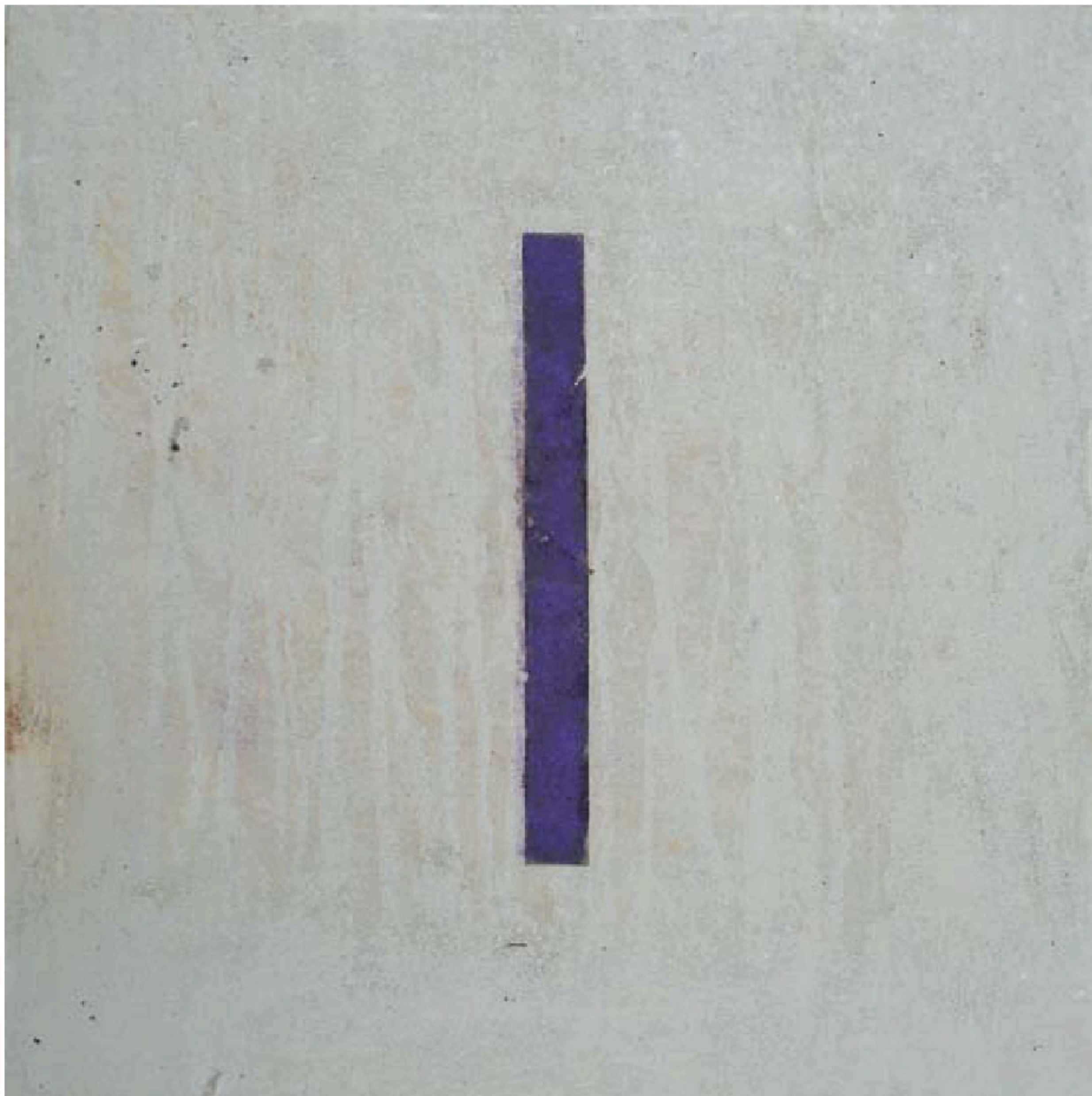
A17 \ 40x40cm \ Mixed media on canvas