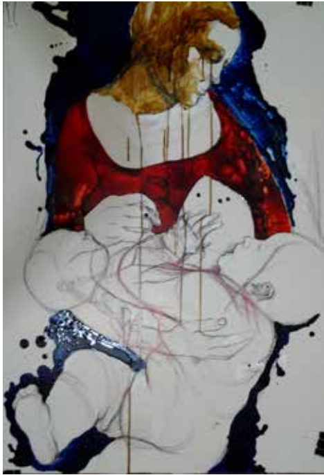
وئام المصري / Weaam El-masry