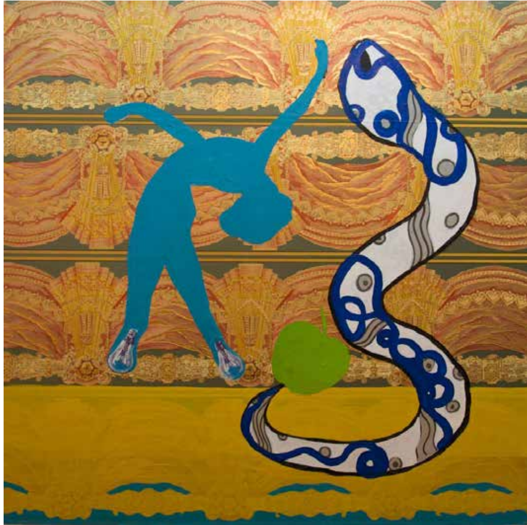
Shaimaa Kamel / شيماء كامل