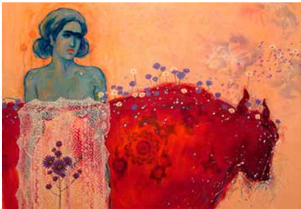
Eman Osama / إيمان أسامة

120 x 80 cm, painting, mixed media on paper, 2013