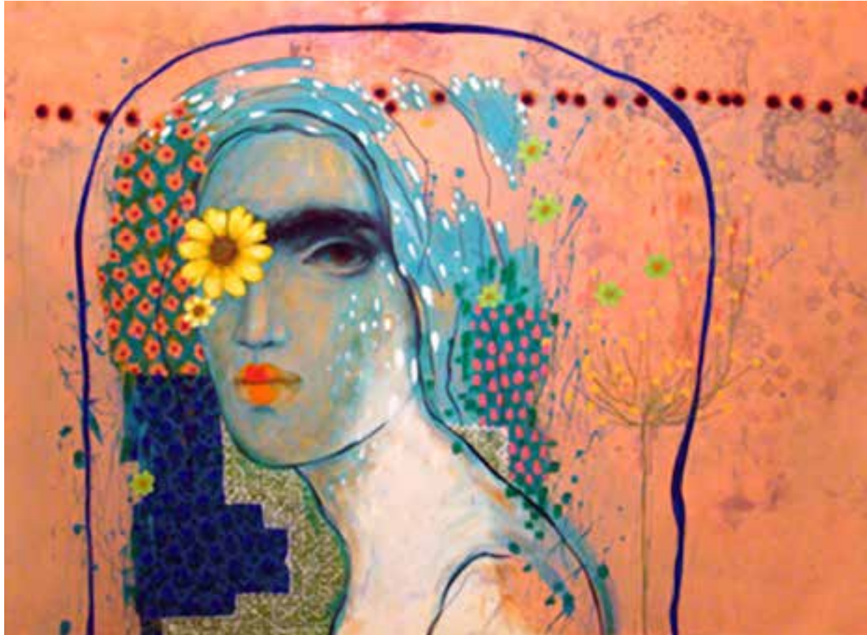
Eman Osama / إيمان أسامة

120 x 80 cm, painting, mixed media on paper, 2013