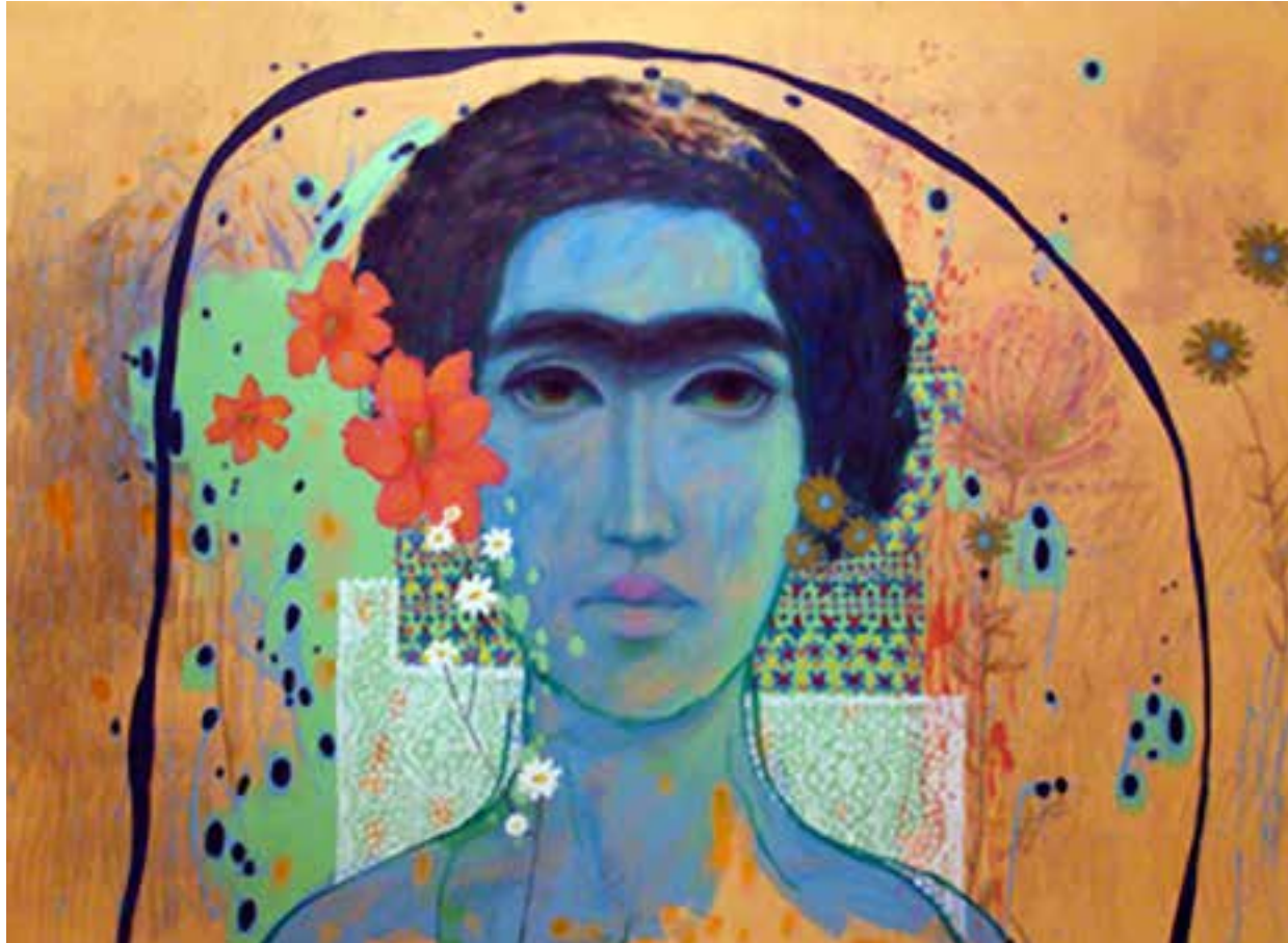
Eman Osama / إيمان أسامة

120 x 80 cm, painting, mixed media on paper, 2013