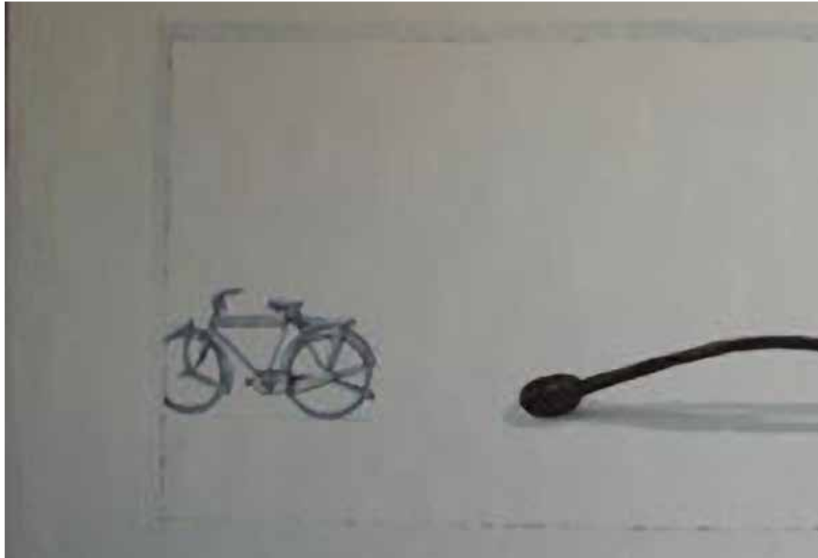
Hanan El-sheikh / حنان الشيخ