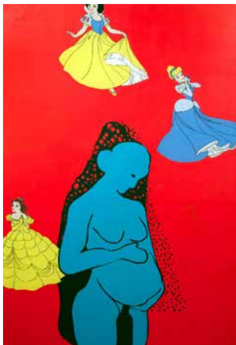
Shaimaa Kamel / شيماء كامل