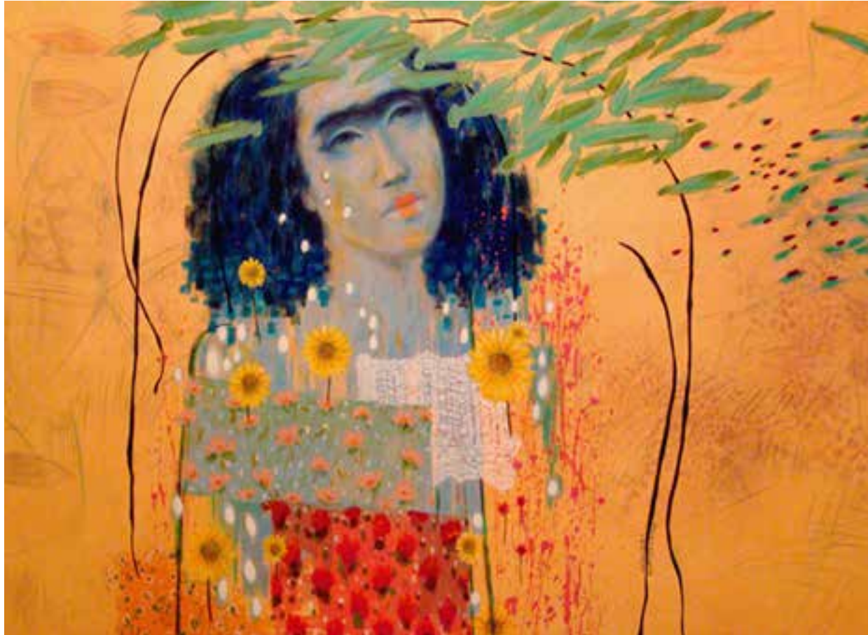
Eman Osama / إيمان أسامة

120 x 80 cm, painting, mixed media on paper, 2013