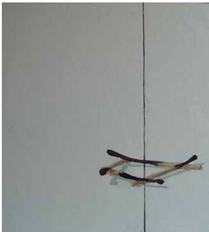
Hanan El-sheikh / حنان الشيخ