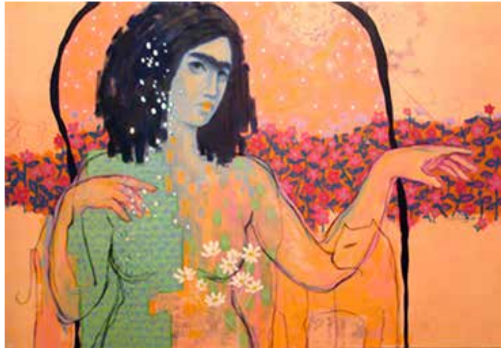
Eman Osama / إيمان أسامة

120 x 80 cm, painting, mixed media on paper, 2013