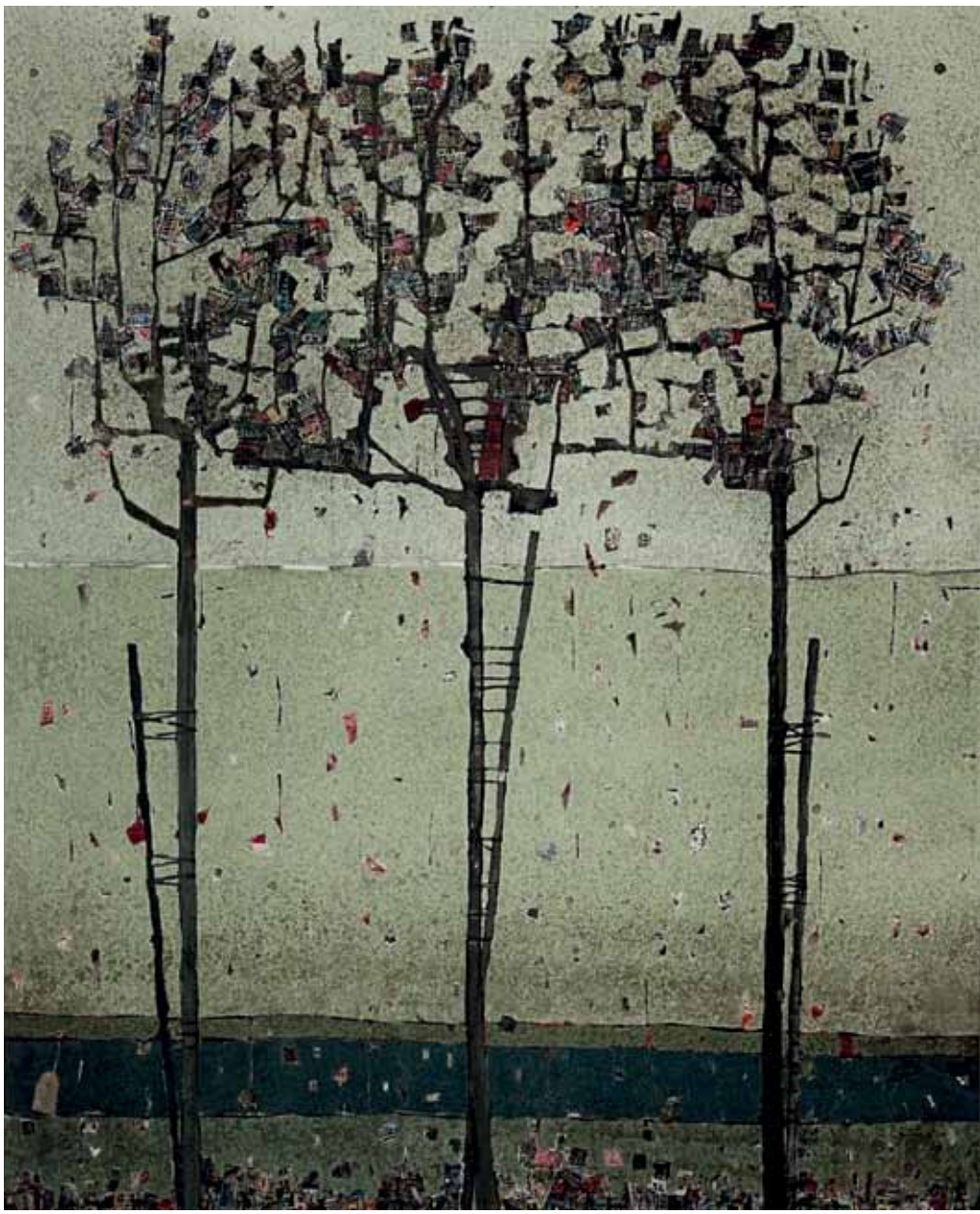
City trees en hommage a schiele | Mixed Media and Collage on Canvas | 220 x 180cm | 2010