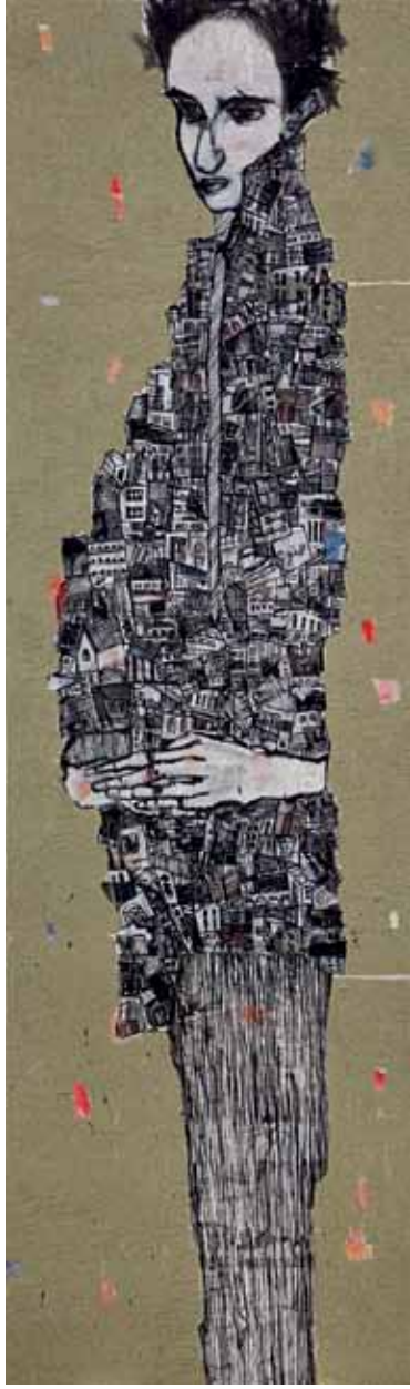
Portrait of my city 2 | Mixed Media and Collage on Canvas | 170 x 50cm | 2010