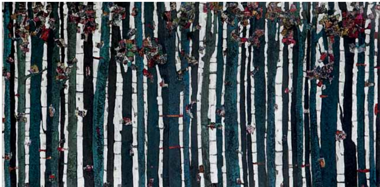
My city trees 2 | Mixed Media and Collage on Canvas | 200 x 100cm | 2010