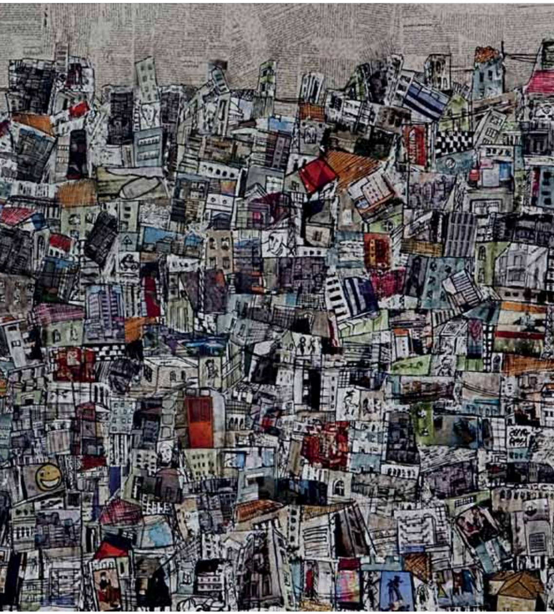
News of my city 2 | Mixed Media and Collage on Canvas | 200 x 100cm | 2010