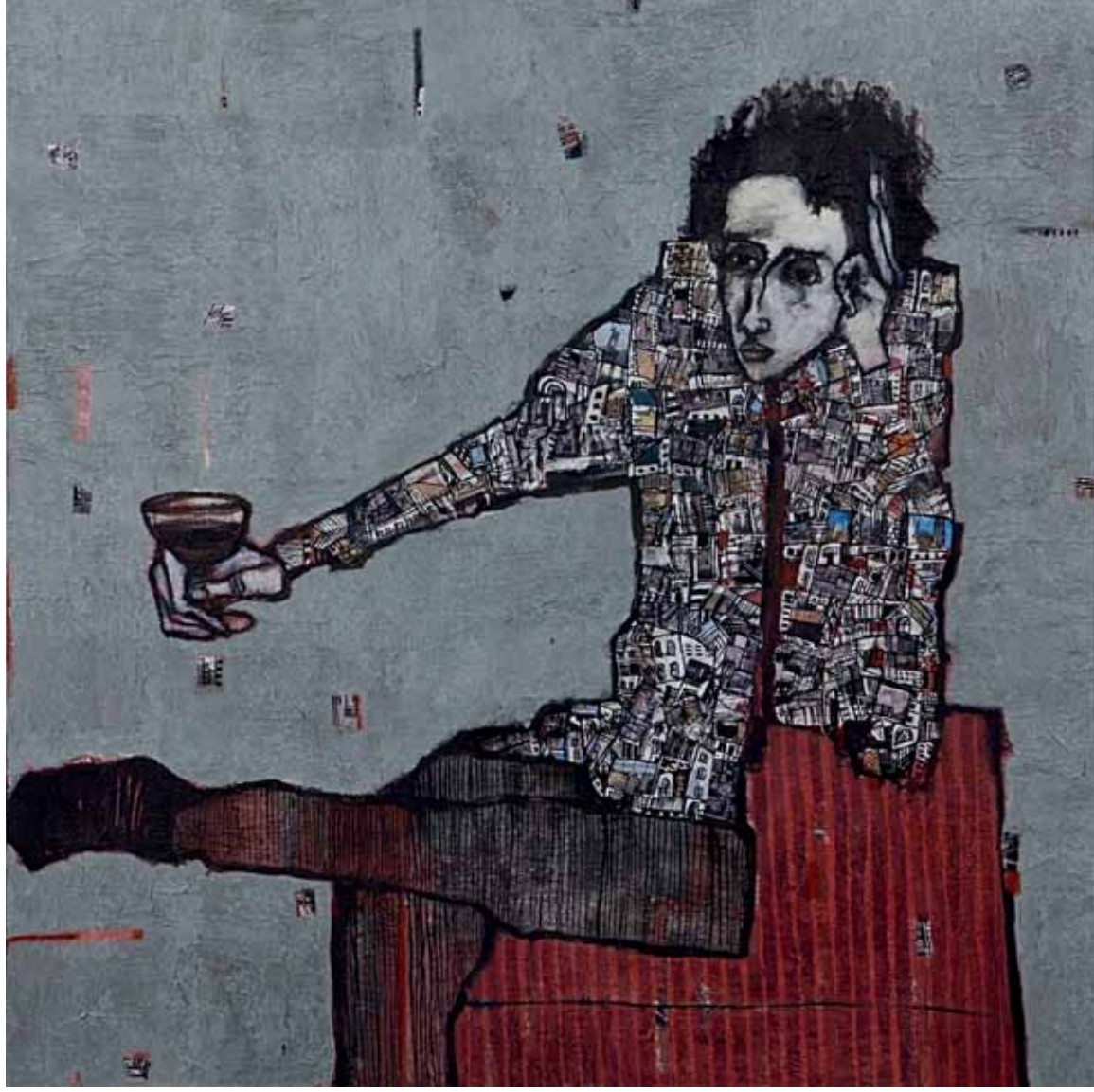
There's a poet in my city | Mixed Media and Collage on Canvas | 120 x 120cm | 2010