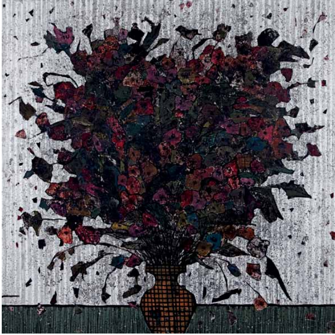
Bouquet on green table | Mixed Media on Canvas | 195 x 195cm | 2010