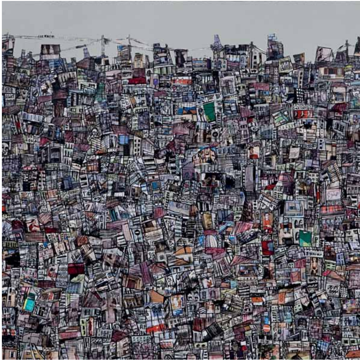
My city in April 10 | Mixed Media and Collage on Canvas | 120 x 120cm | 2010