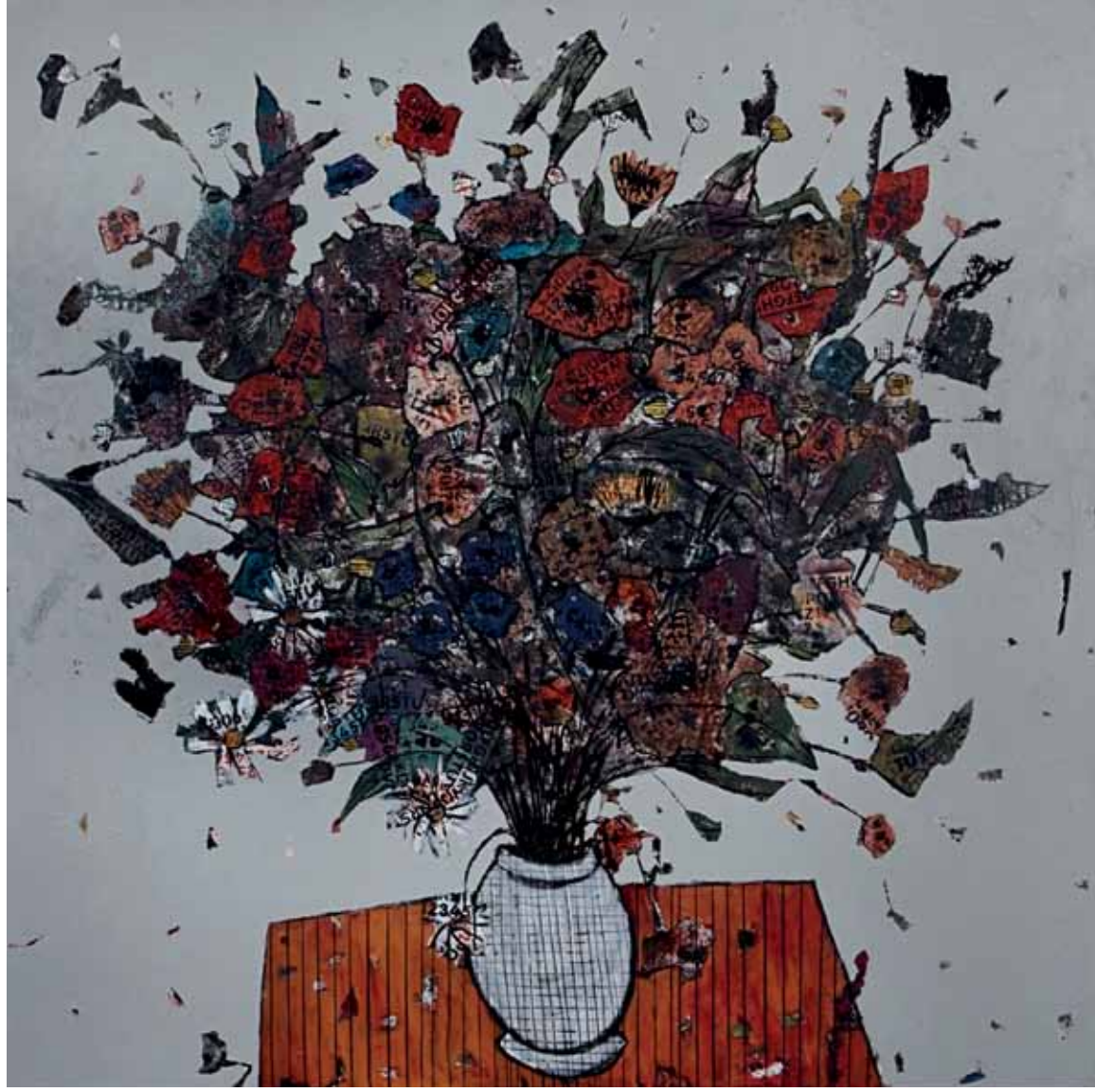
Bouquet on orange table | Mixed Media on Canvas | 195 x 195cm | 2010