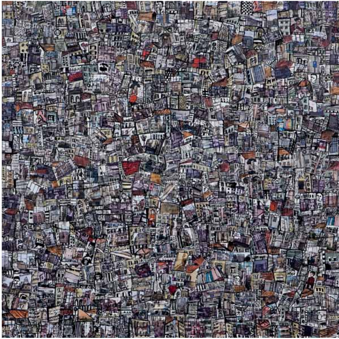
My city in a frame | Mixed Media and Collage on Canvas | 120 x 120cm | 2010