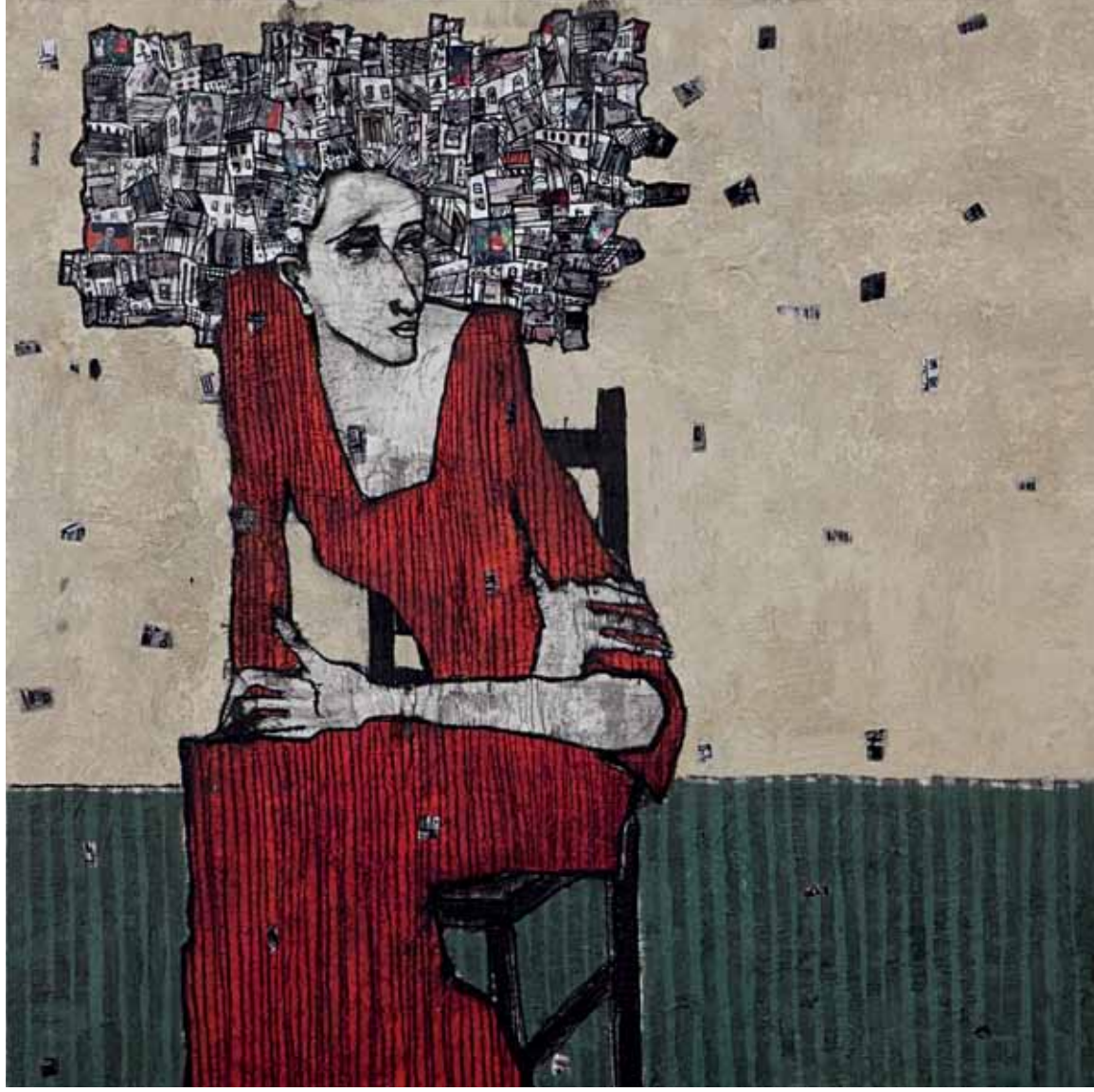
My city in cy hair 2 | Mixed Media and Collage on Canvas | 120 x 120cm | 2010