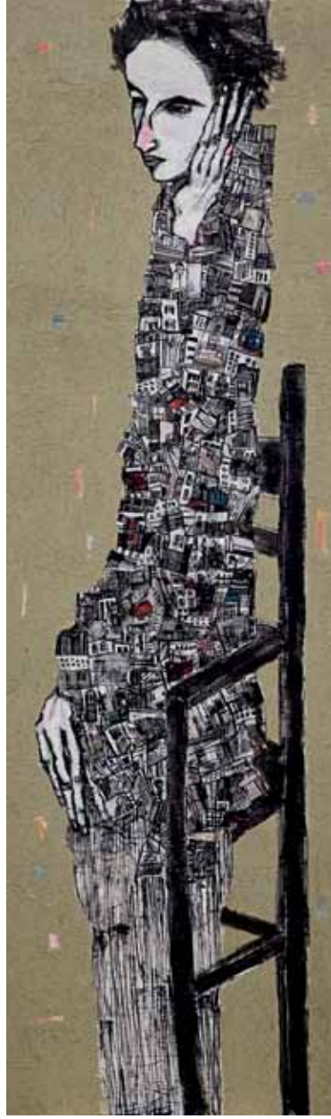
Portrait of my city 3 | Mixed Media and Collage on Canvas | 170 x 50cm | 2010