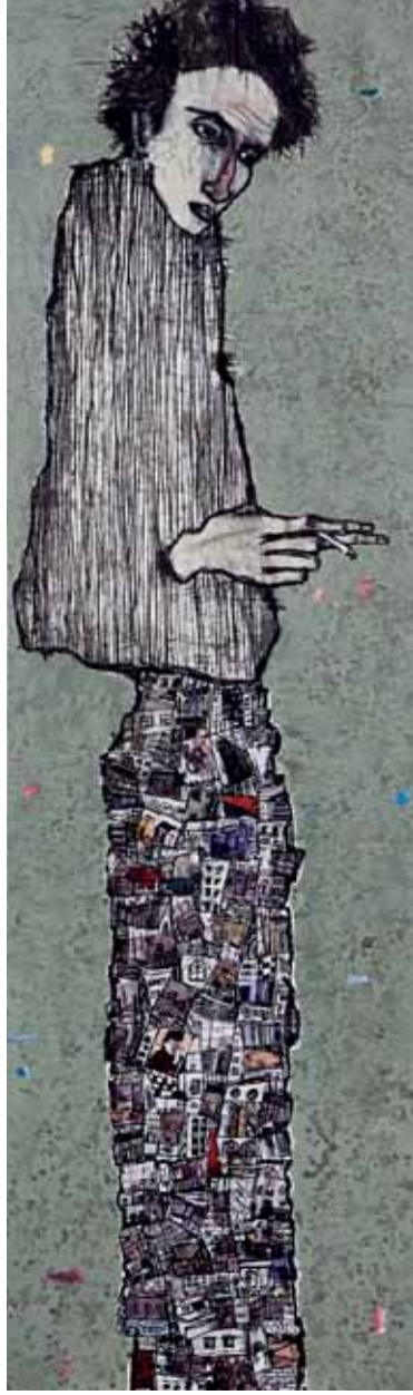
Portrait of my city 1 | Mixed Media and Collage on Canvas | 170 x 50cm | 2010