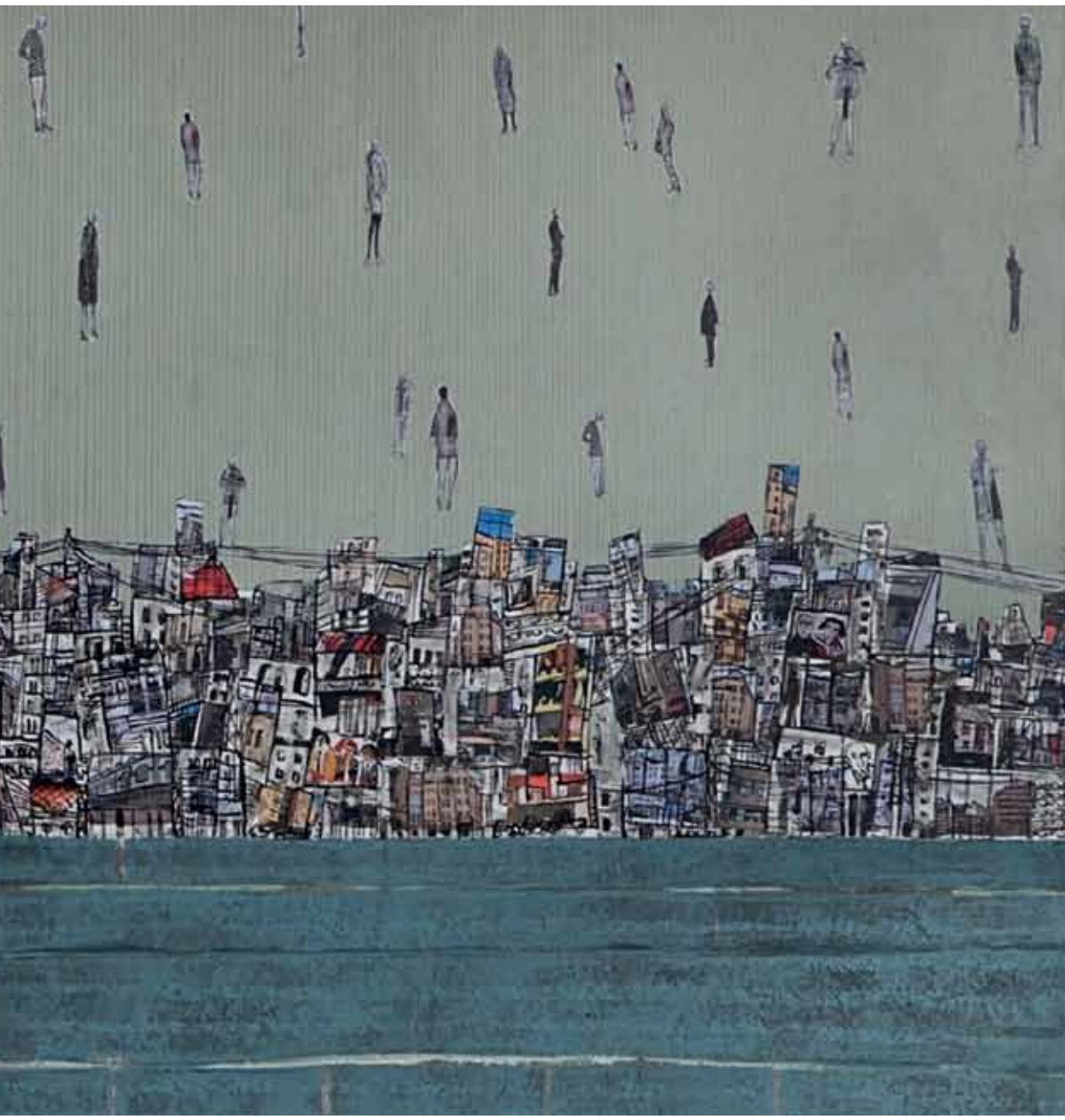
My city en hommage a magritte | Mixed Media and Collage on Canvas | 200 x 100cm | 2010