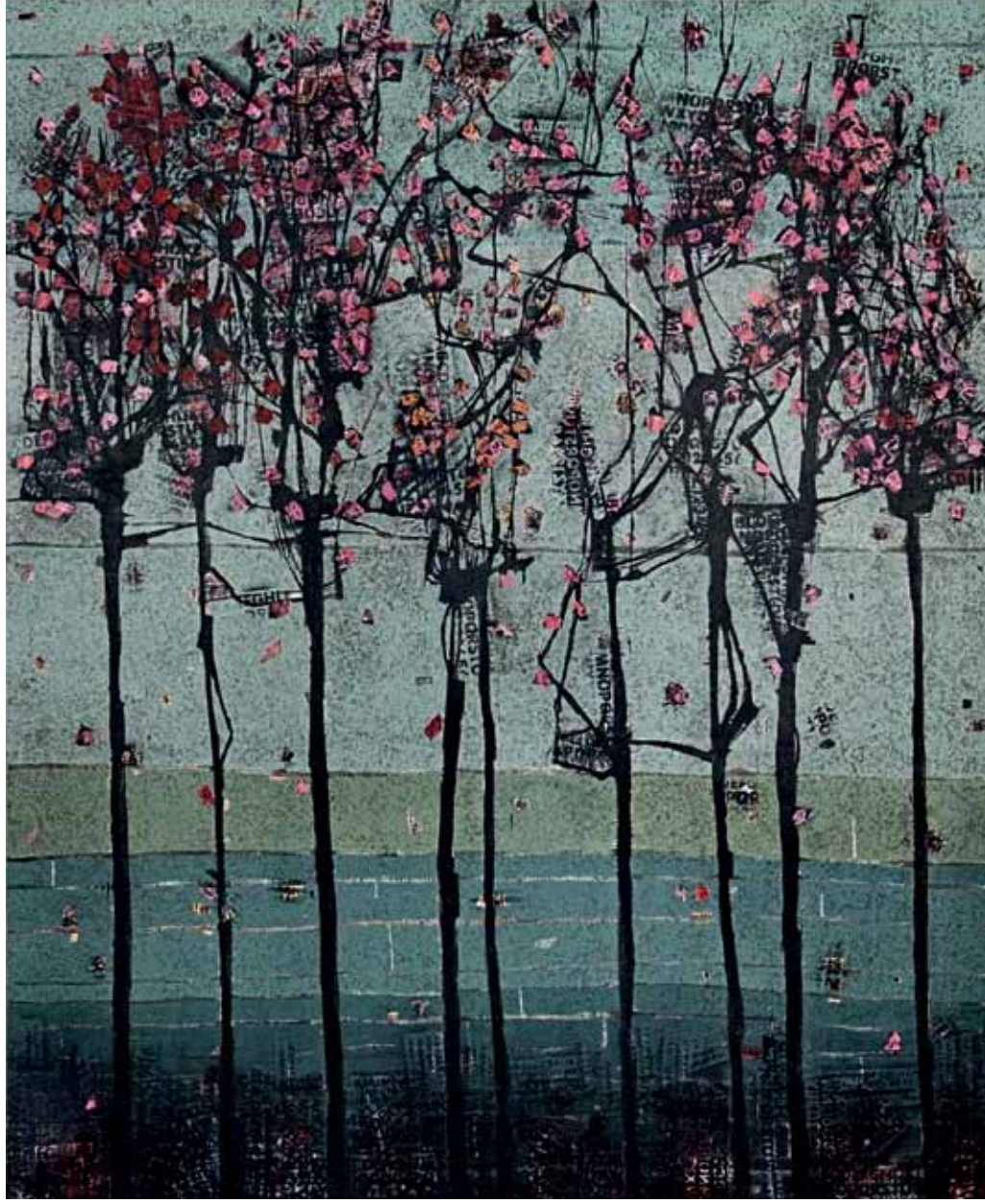
My city trees 5 | Mixed Media and Collage on Canvas | 220 x 180cm | 2010