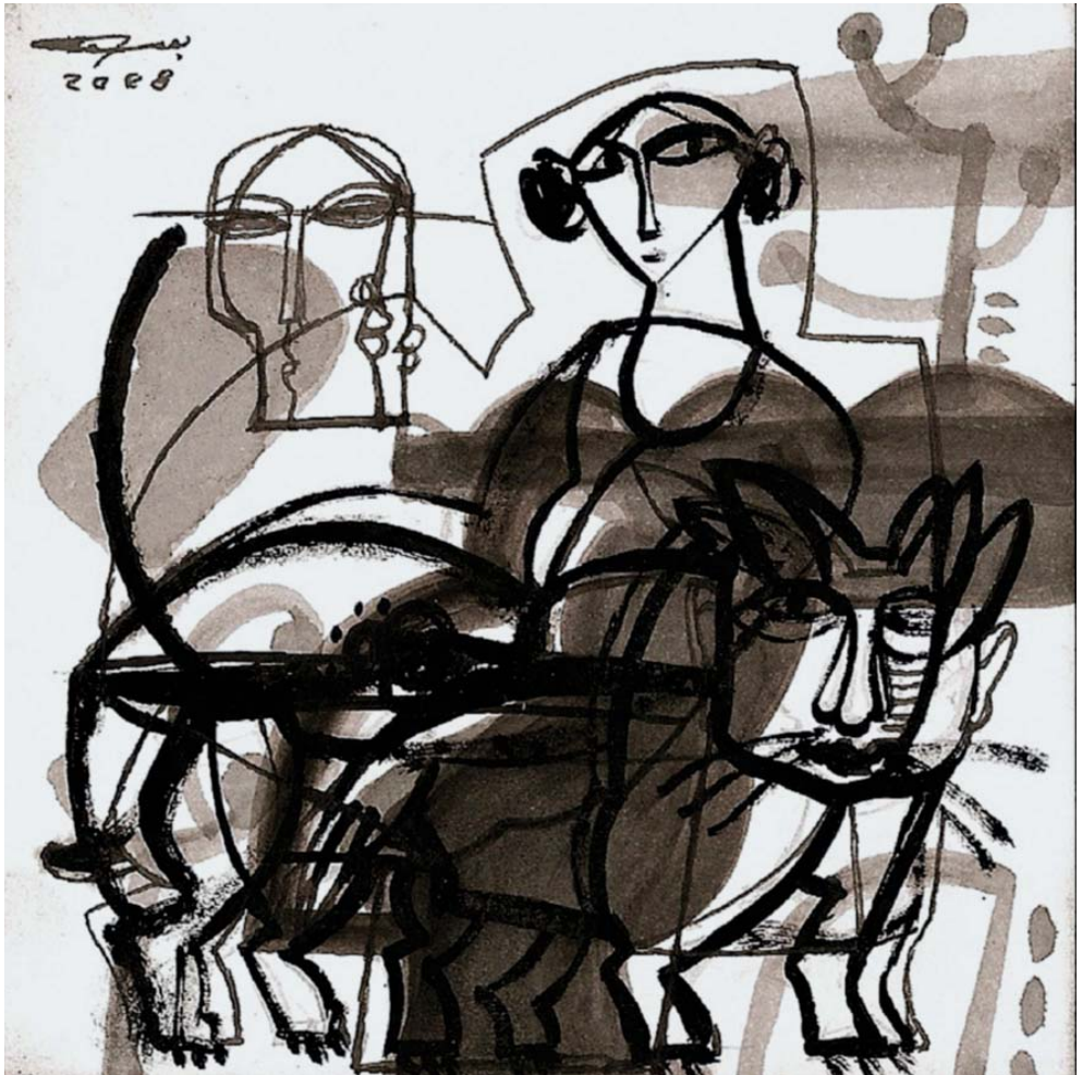
Untitled 20 | Ink on paper | 10 x 10 cm | 2008