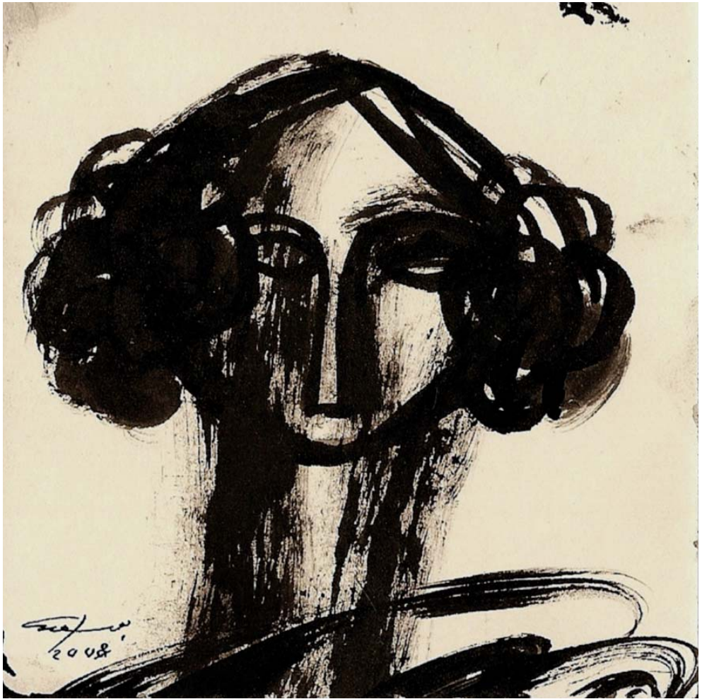
Untitled 8 | Ink on paper | 10 x 10 cm | 2008