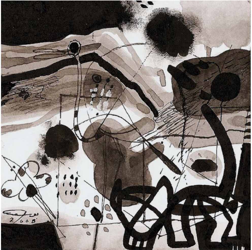
Untitled 12 | Ink on paper | 10 x 10 cm | 2008