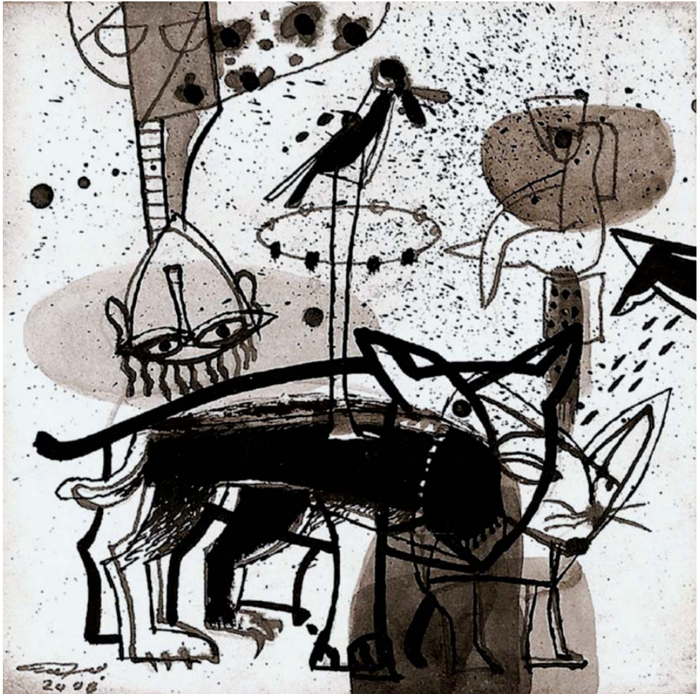
Untitled 7 | Ink on paper | 10 x 10 cm | 2008