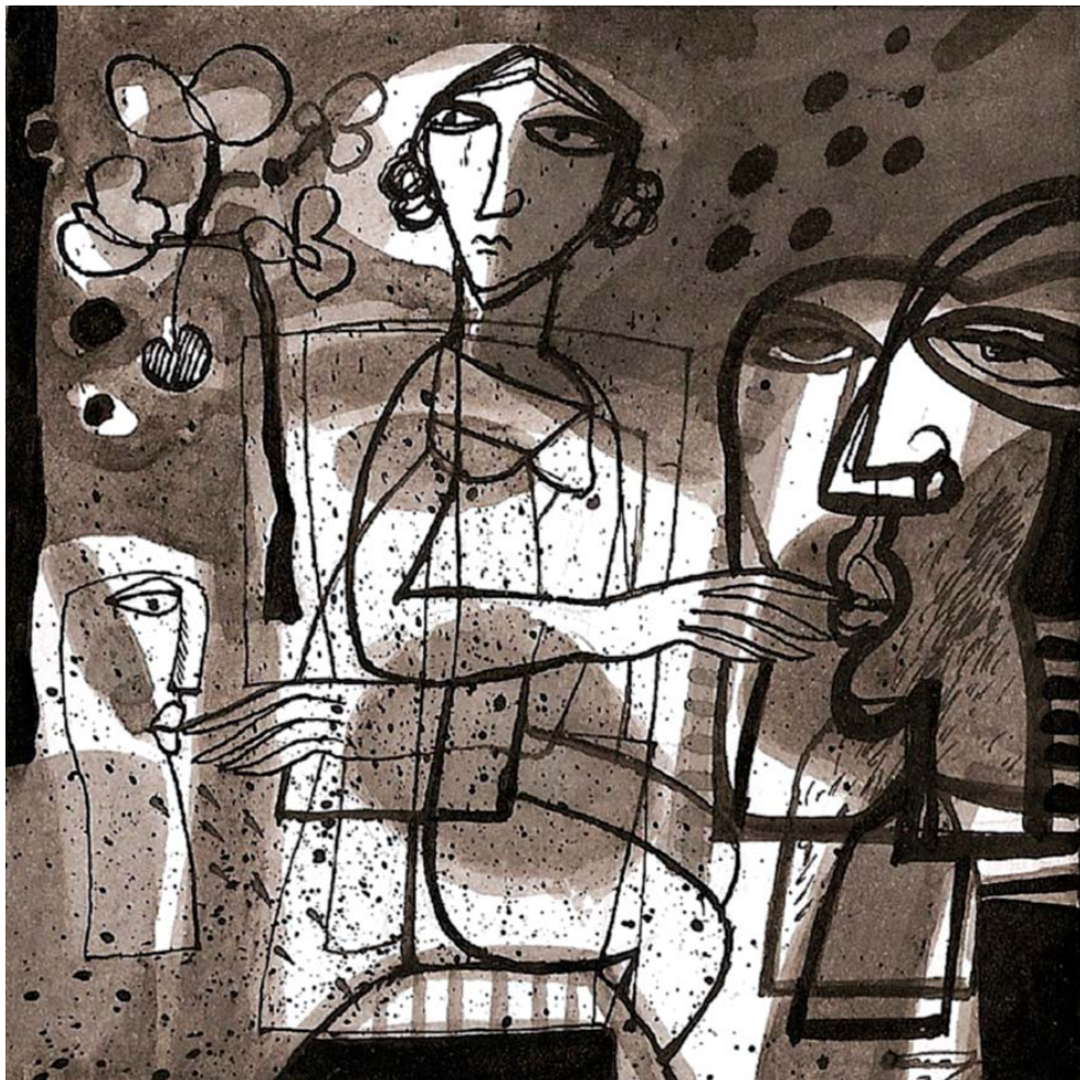
Untitled 2 | Ink on paper | 10 x 10 cm | 2008