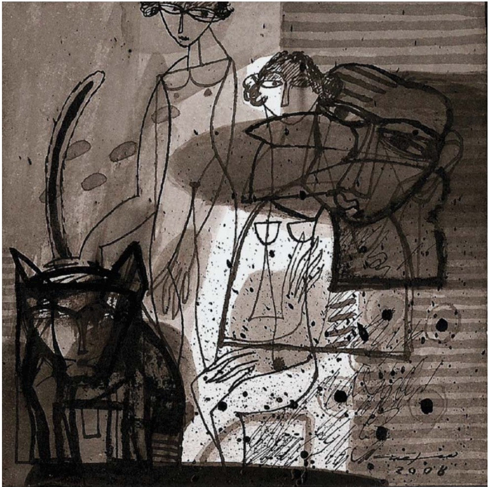
Untitled 16 | Ink on paper | 10 x 10 cm | 2008