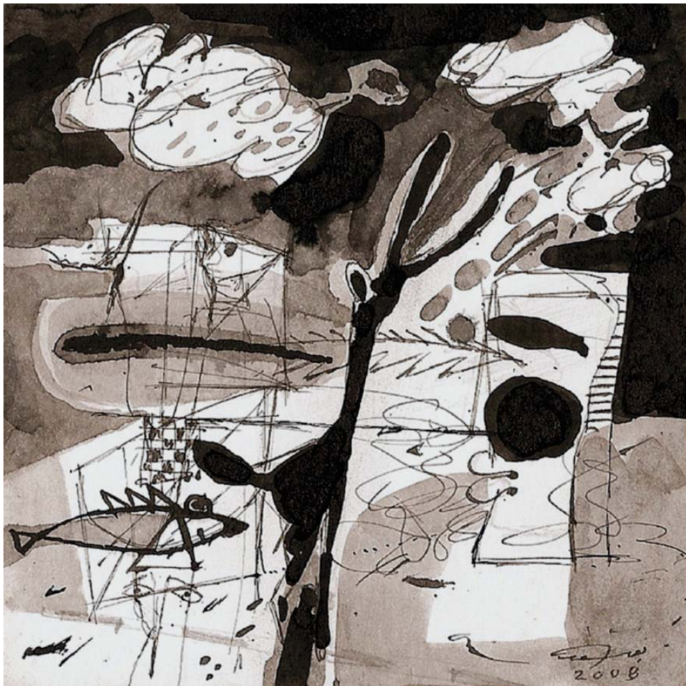
Untitled 18 | Ink on paper | 10 x 10 cm | 2008