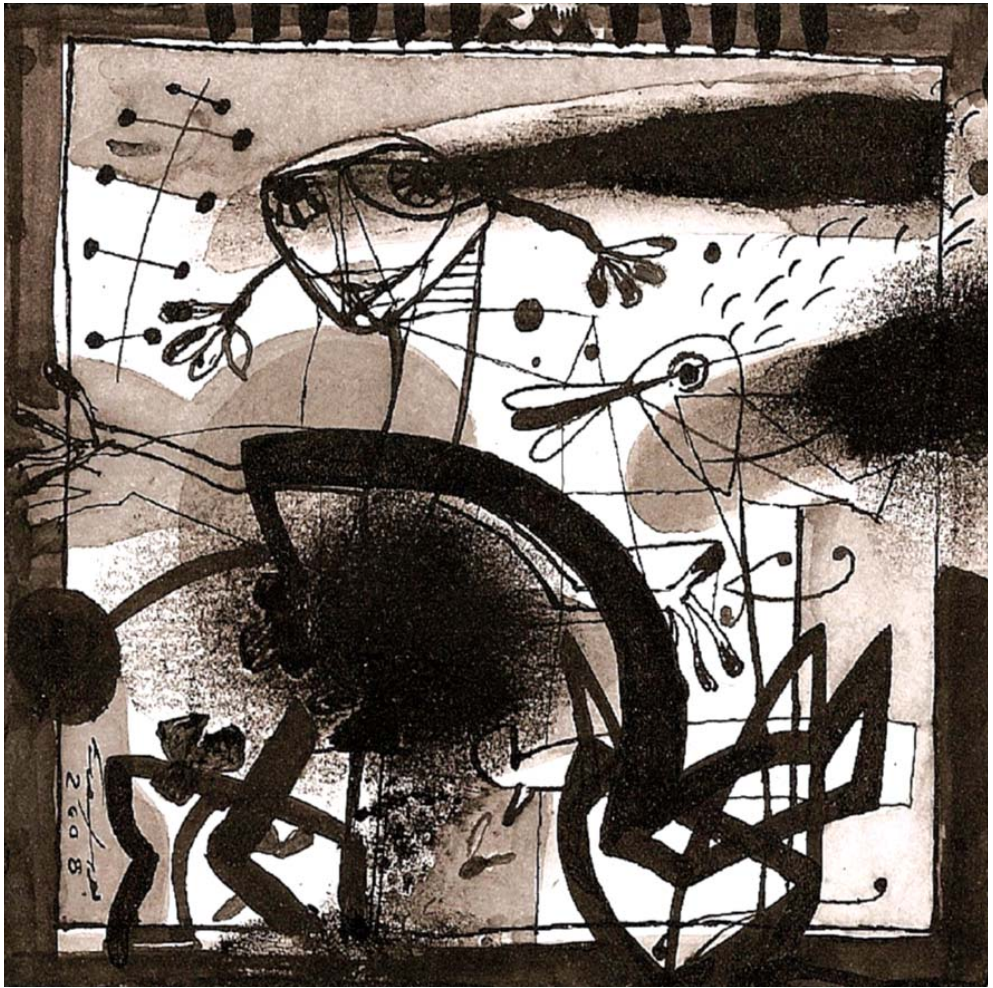
Untitled 5 | Ink on paper | 10 x 10 cm | 2008