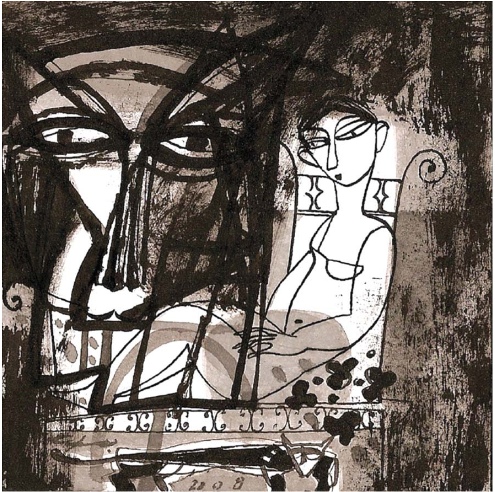
Untitled 6 | Ink on paper | 10 x 10 cm | 2008