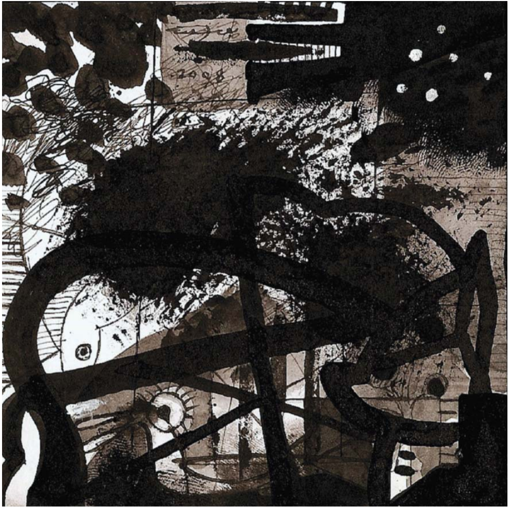
Untitled 13 | Ink on paper | 10 x 10 cm | 2008