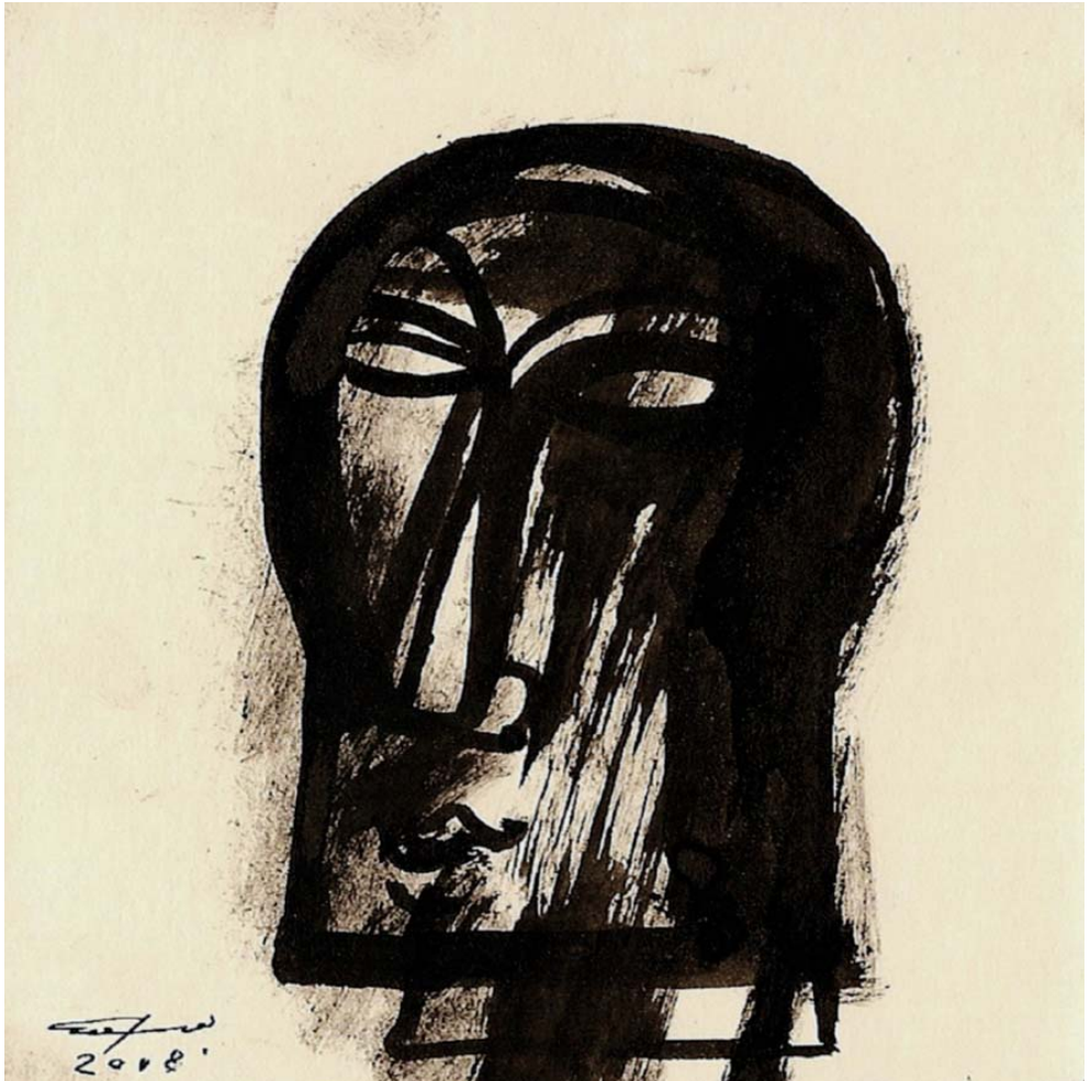
Untitled 10 | Ink on paper | 10 x 10 cm | 2008