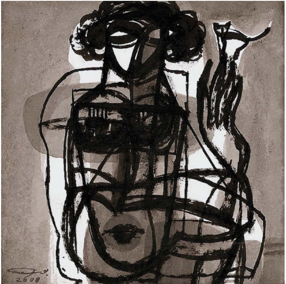
Untitled 15 | Ink on paper | 10 x 10 cm | 2008