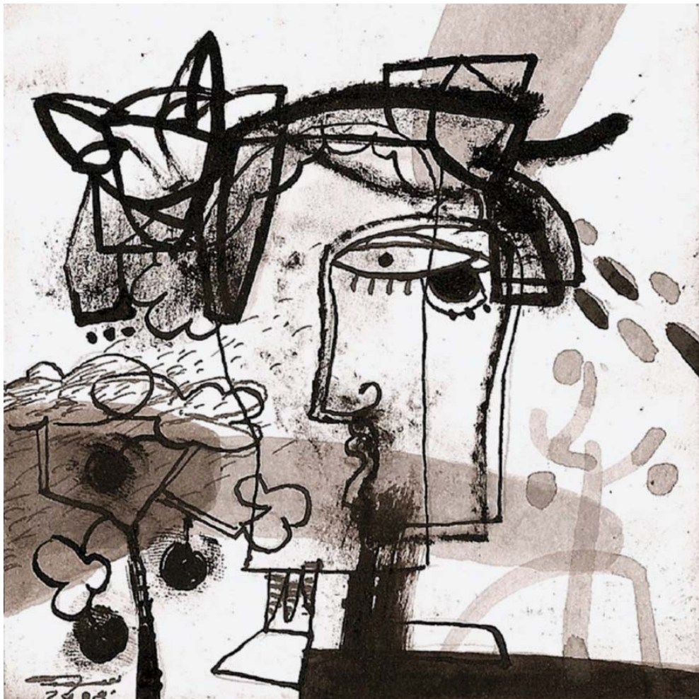
Untitled 3 | Ink on paper | 10 x 10 cm | 2008