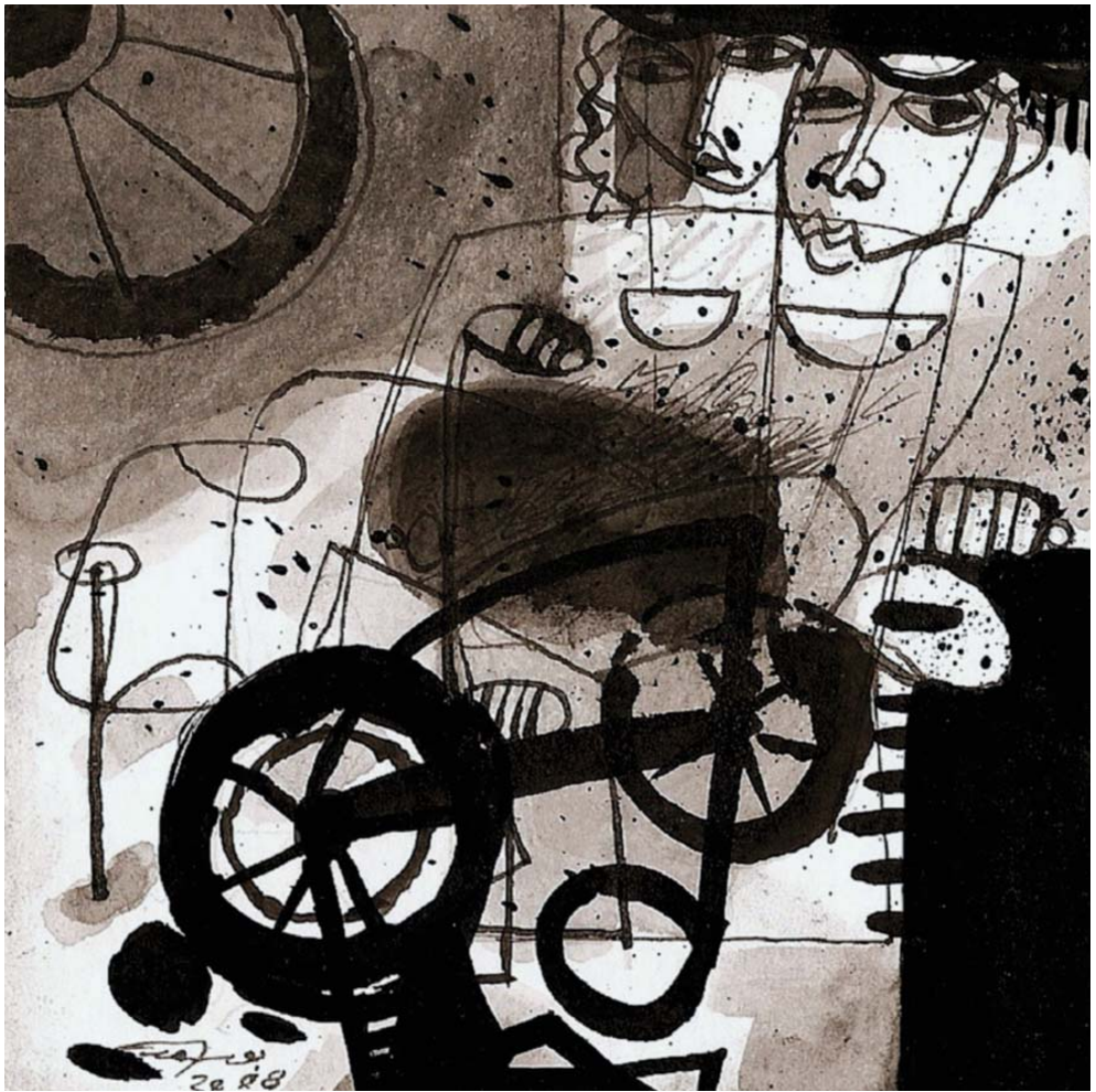
Untitled 14 | Ink on paper | 10 x 10 cm | 2008