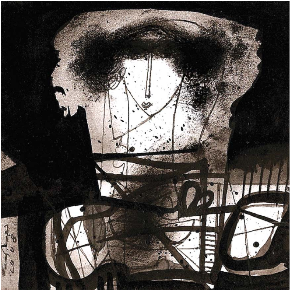
Untitled 4 | Ink on paper | 10 x 10 cm | 2008