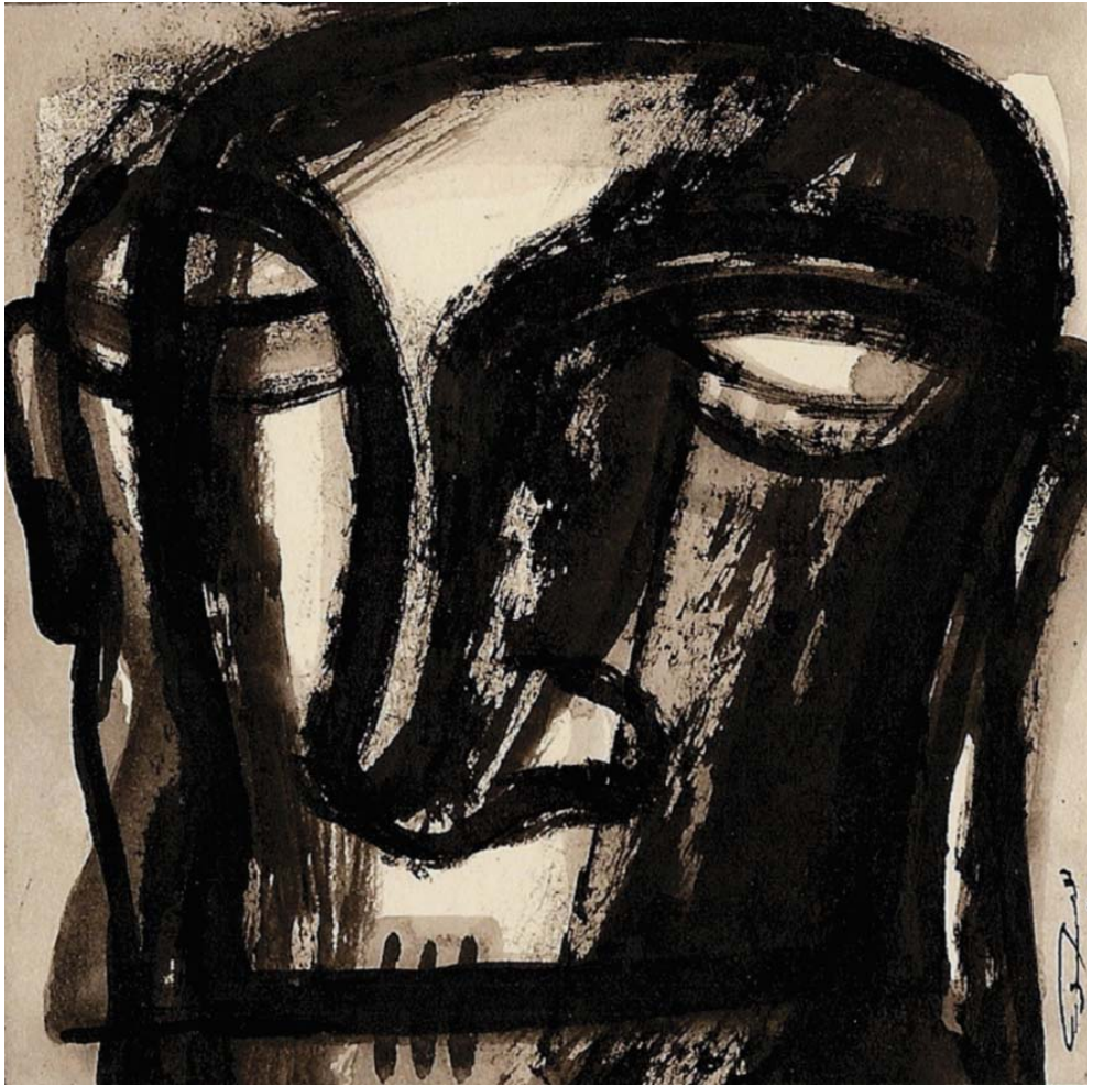
Untitled 17 | Ink on paper | 10 x 10 cm | 2008