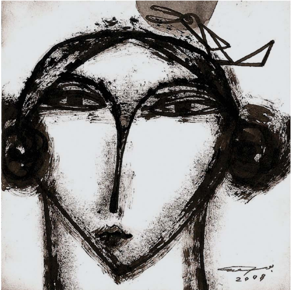
Untitled 19 | Ink on paper | 10 x 10 cm | 2008