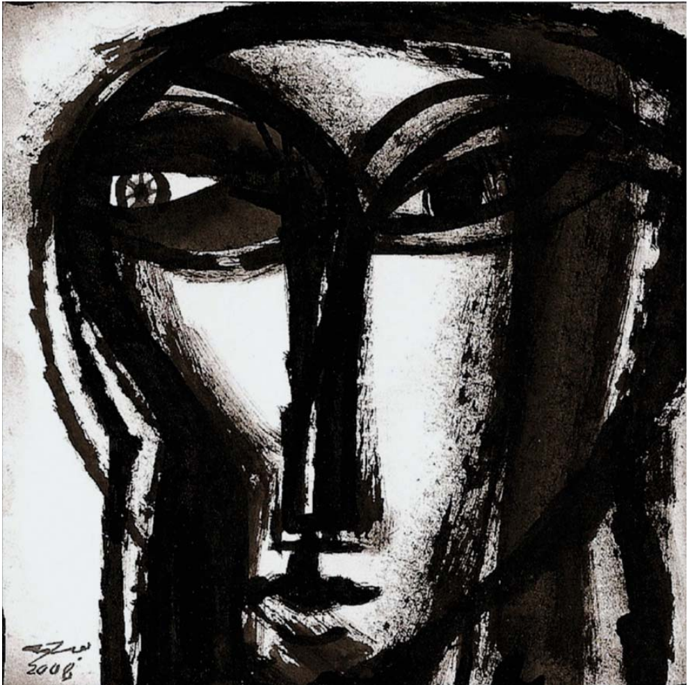
Untitled 9 | Ink on paper | 10 x 10 cm | 2008