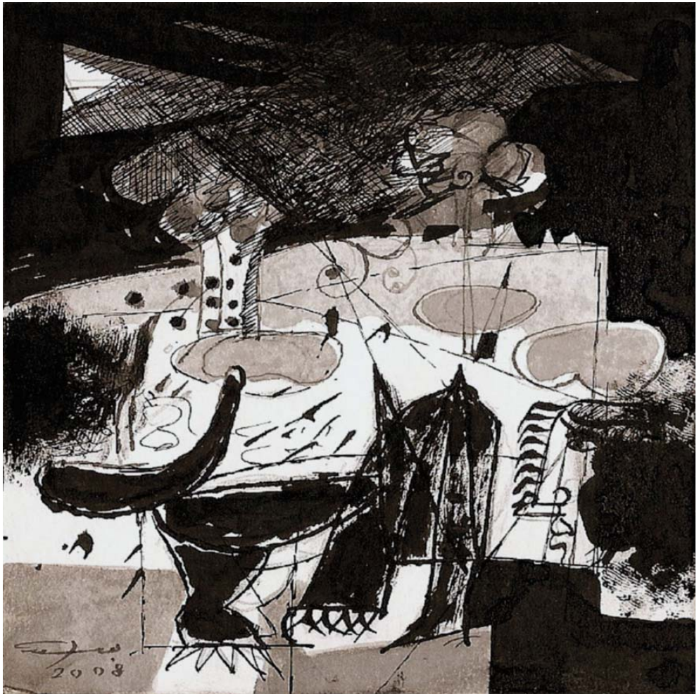
Untitled 11 | Ink on paper | 10 x 10 cm | 2008